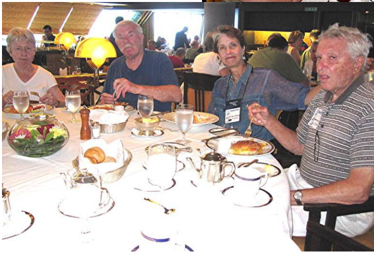
as shown below.